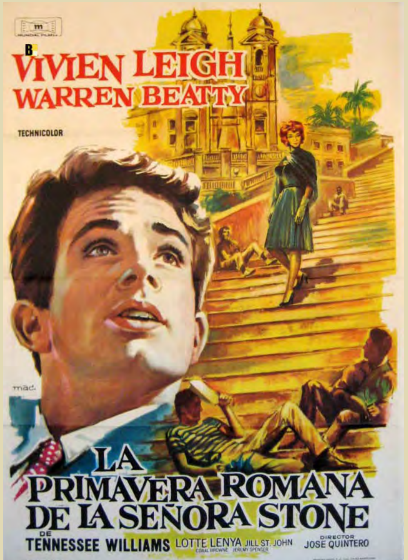
The Roman Spring of Mrs. Stone, 1961

Karen Stone (Vivien Leigh), an actress, and her businessman husband are off on holiday to Rome. On the plane, her husband suffers a fatal heart attack.