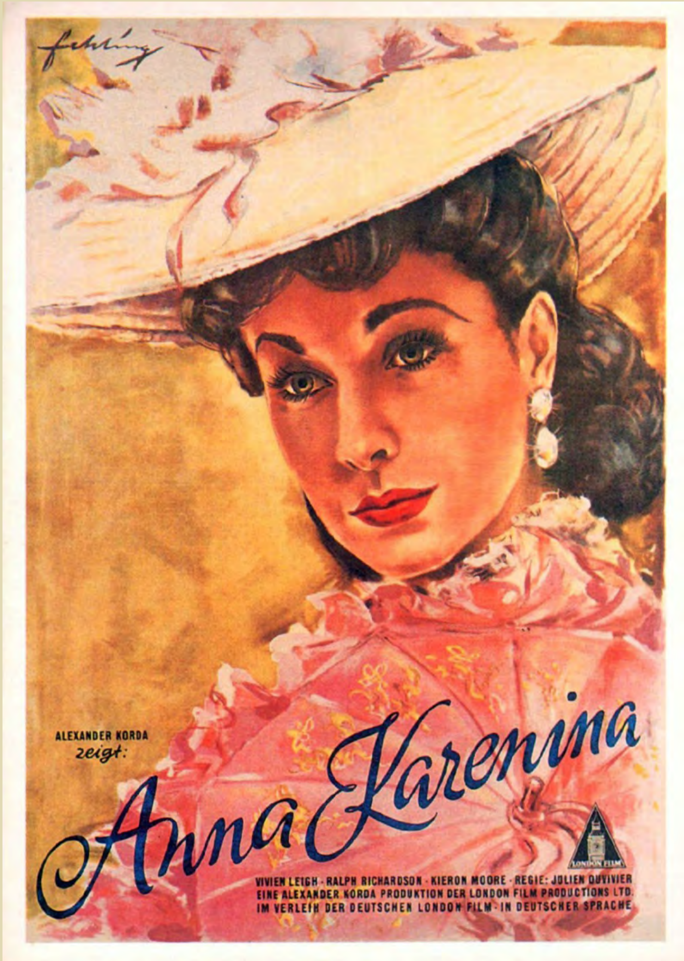
Anna Karenina, 1948

Anna Karenina is a novel by the Russian writer Leo Tolstoy, published in serial installments from 1873 to 1877 in the periodical The Russian Messenger. Tolstoy clashed with its editor Mikhail Katkov over political issues that arose in the final installment (Tolstoy's unpopular views of volunteers going to Serbia); therefore, the novel's first complete appearance was in book form.