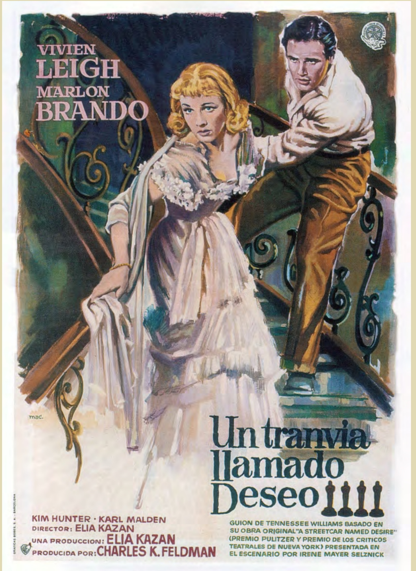
A Streetcar Named Desire, 1951

Disturbed Blanche DuBois moves in with her sister in New Orleans and is tormented by her brutish brother-in-law while her reality crumbles around her.