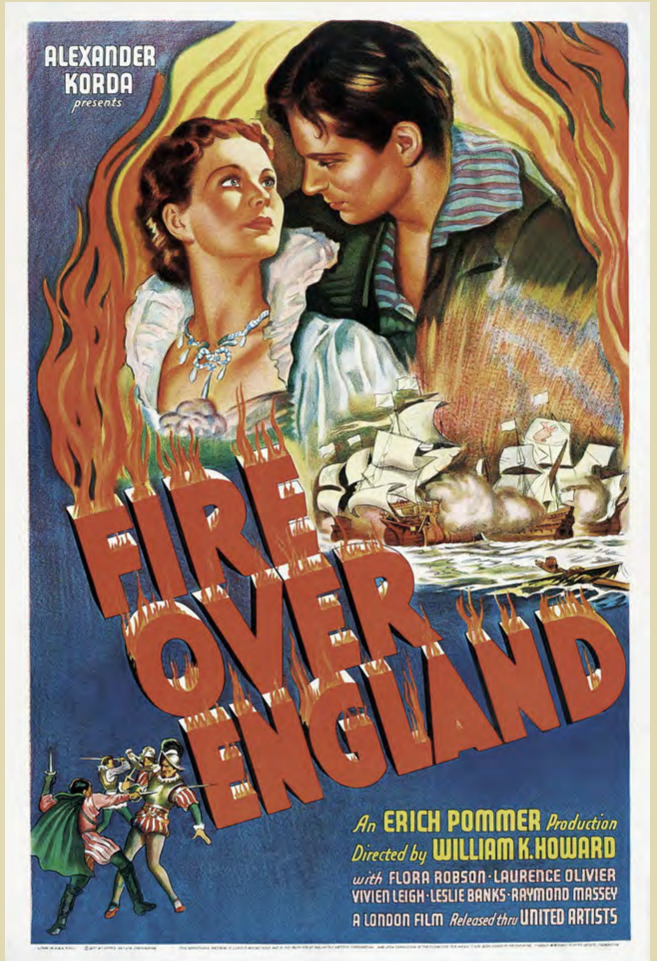
Fire Over England, 1936

In 1588, relations between Spain and England are at the breaking point. With the support of Queen Elizabeth I, English sea raiders such as Sir Francis Drake regularly capture Spanish merchantmen bringing gold from the New World.