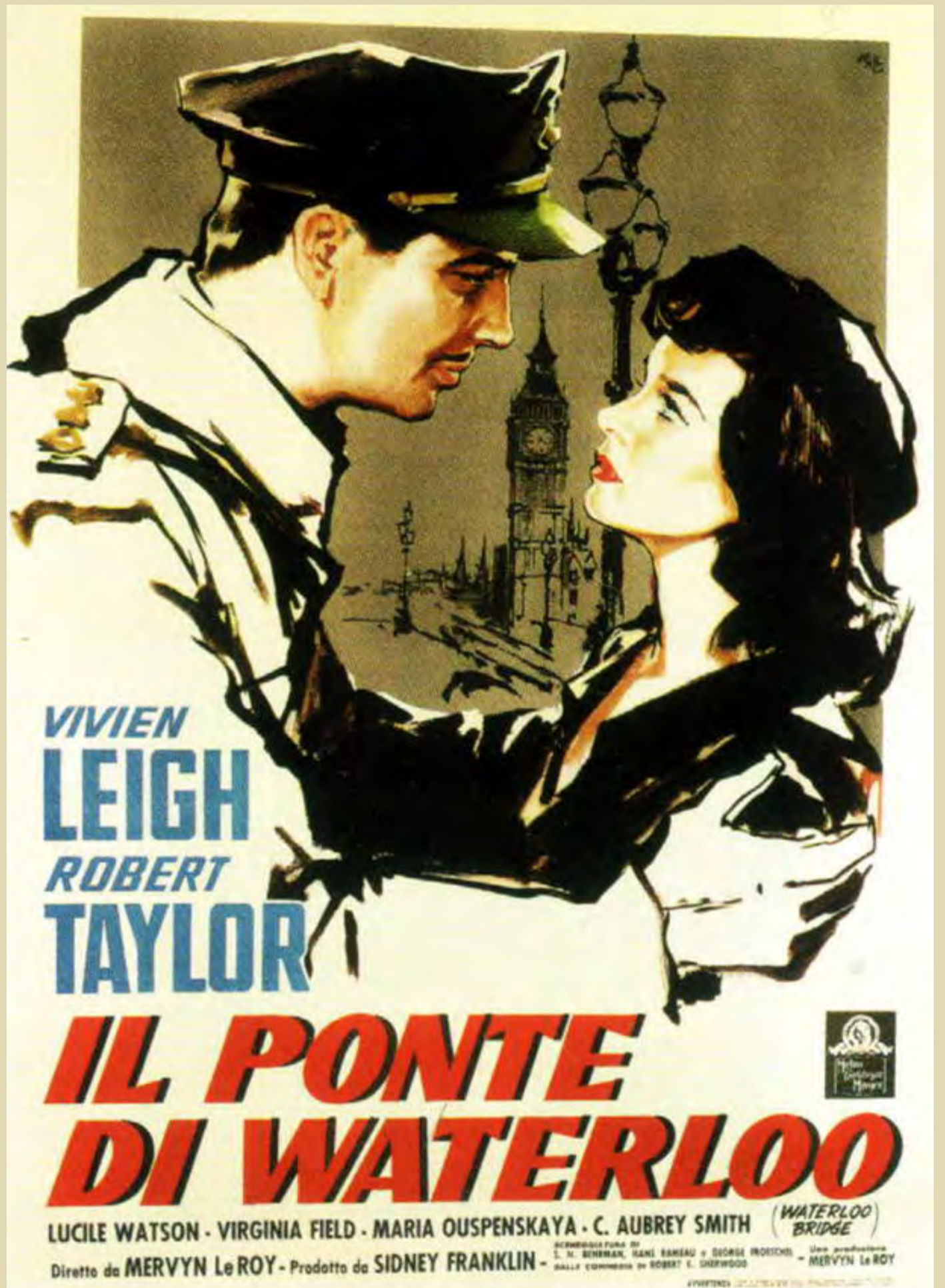
Waterloo Bridge, 1940

Waterloo Bridge is a road and foot traffic bridge crossing the River Thames in London, England between Blackfriars Bridge and Hungerford Bridge. The name of the bridge is in memory of the Anglo-Dutch and Prussian victory at the Battle of Waterloo in 1815.