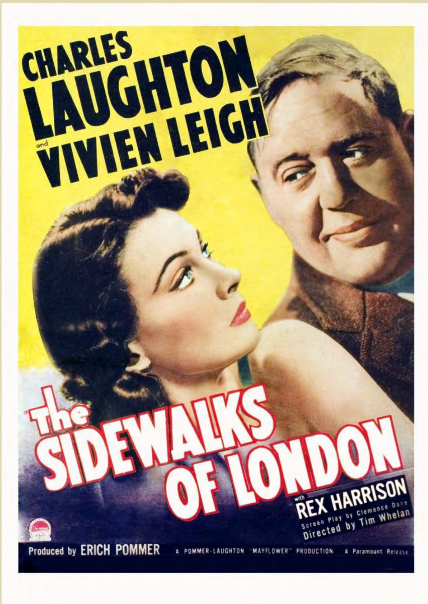
Sidewalks of London, 1938