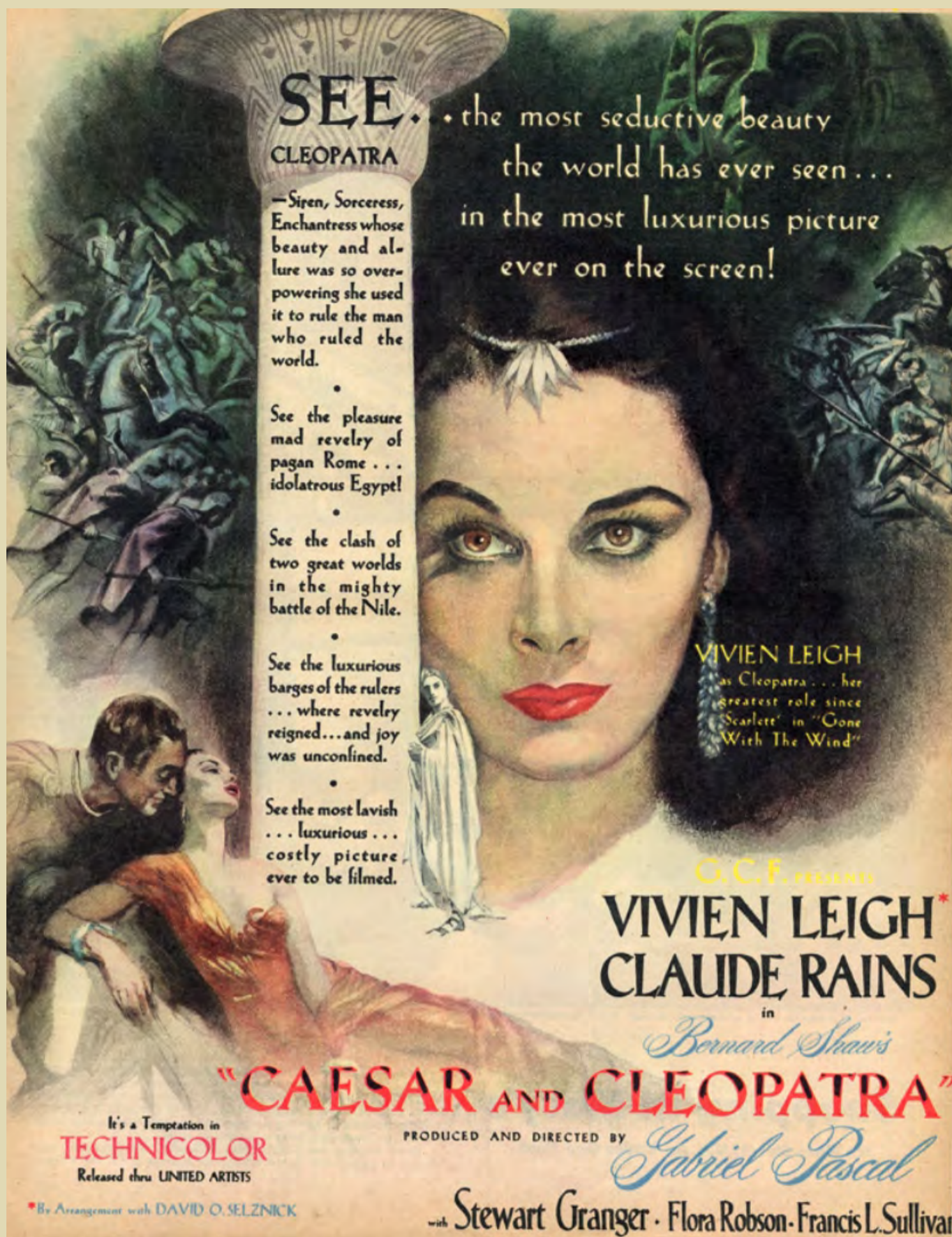
Caesar and Cleopatra, 1945

Cleopatra hasn't been on the throne of the pharaohs of Egypt very long when Julius Caesar pays a visit. Caesar finds the prospect of romance more tempting than he expected, since Cleopatra is a rare woman who is bright as well as beautiful.